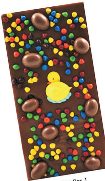
Easter Bar 1