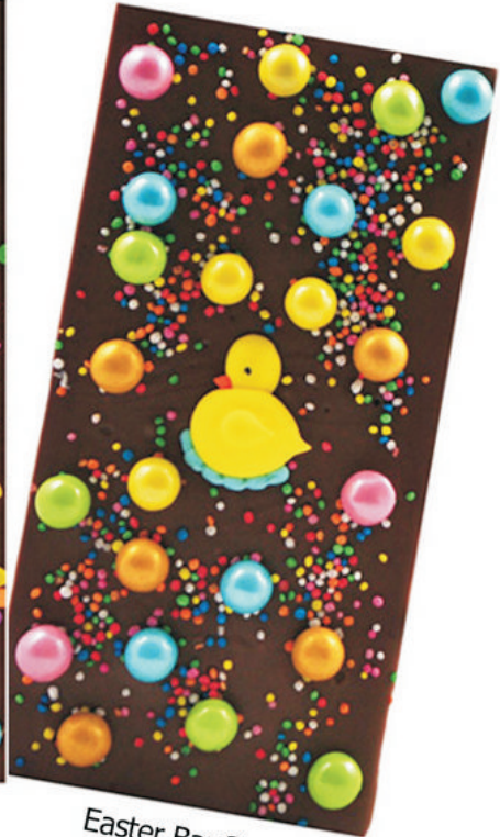
Easter Bar 3