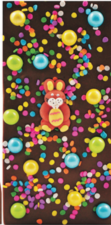
Easter Bar 2